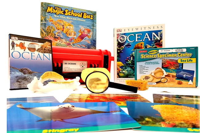
The complete contents of the Oceans S.M.A.R.T. Case