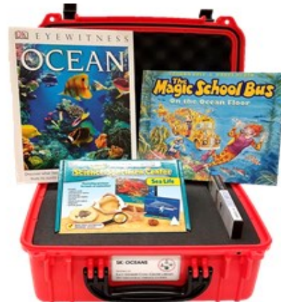
A look inside the Oceans S.M.A.R.T. Case